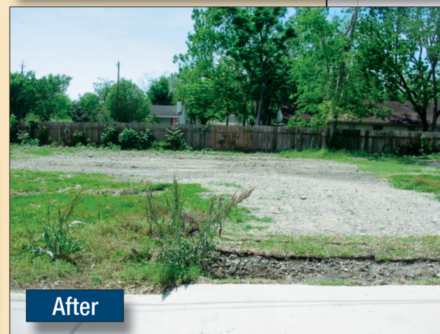
The two photographs above are before and after photos for a home that was purchased and demolished under the 2008 SRL grant program. A vast savings to the National Flood Insurance Fund will result from the acquisition of this structure.