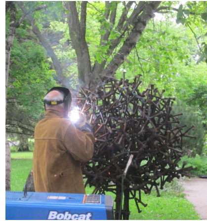
Working this morning on repair.