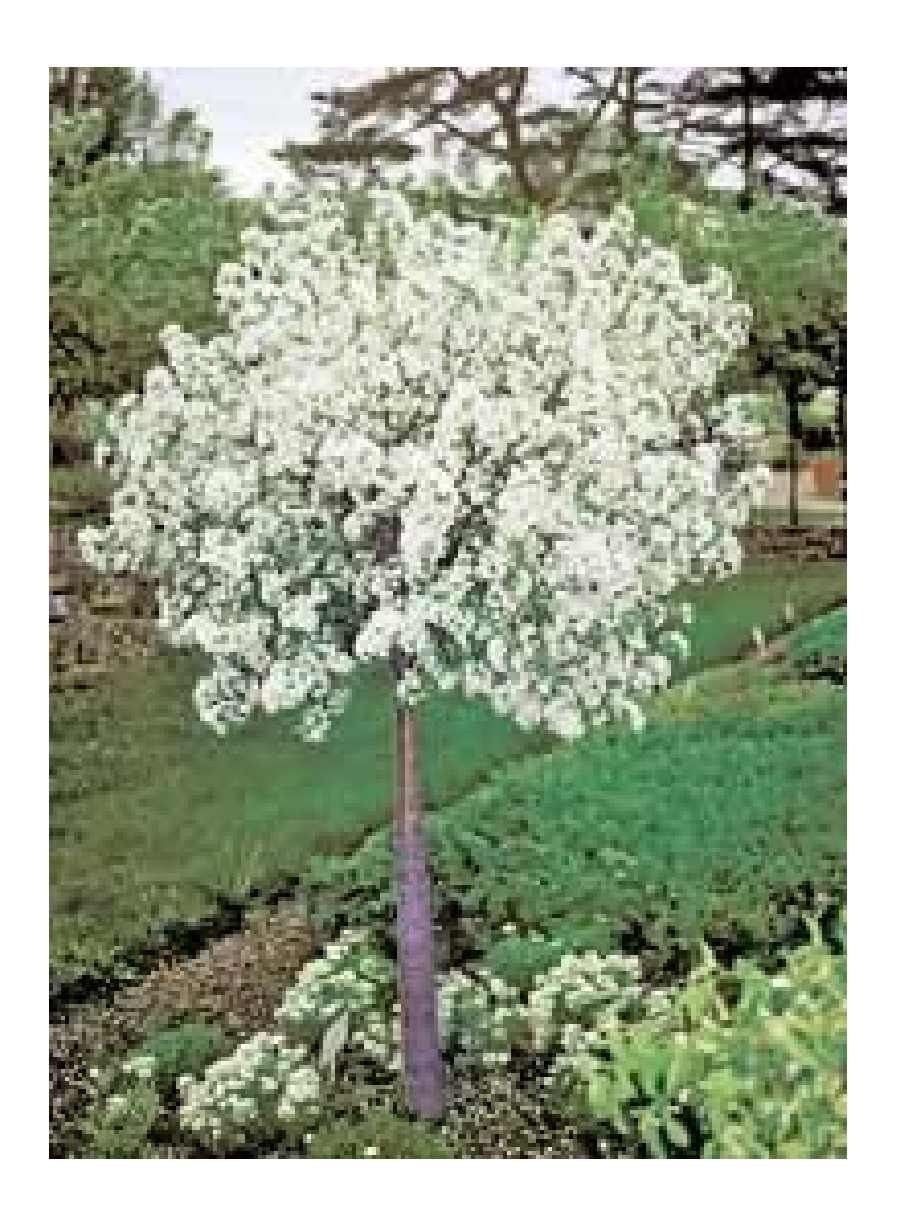
Mature Height 10' to 12'

Pink buds opening to white flowers smother the dense, rounded head of this top-grafted, compact dwarf.