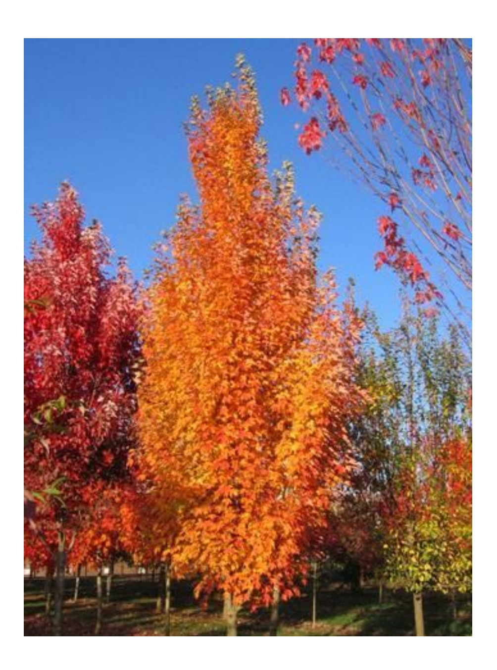
Mature Height 30' to 40'

This is an upright growing form of Red Maple exhibiting wonderful red fall color. It enjoys being in or near turf areas as it thrives in moist soil. Great for smaller yards and tighter spaces.