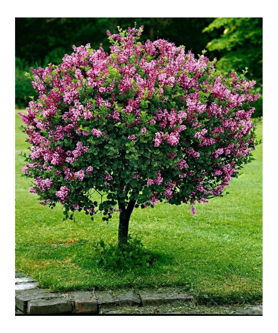
Mature Height 5' to 6'

An excellent globe form for accent or interest in the landscape. Tight clusters of small, lavender pink flowers show in late spring against a mass of dark green leaves. Will grow 5 to 6 feet above the graft union.